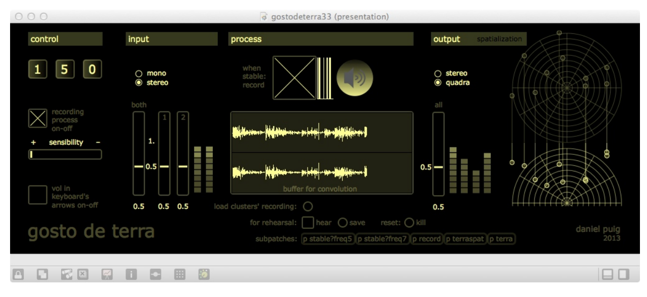
Figure 2. User interface for the patch of gosto de terra .

Bateson clarifies that "the basic rule of systems theory is that, if you want to understand some phenomenon or appearance, you must consider that phenomenon within the context of all completed circuits which are relevant to it" and that a system "is any unit containing feedback structure and therefore competent to process information" [4]. Following the model drawn from systemic thinking, that a system is constituted by its parts and the interrelationships between them, the algorithm presupposes that this system is formed not only by the algorithm and its formalization in a Max/ MSP patch, but also by the piano itself, with the sounding result of the interaction between the performer and the instrument, in a given acoustic space. The interactions between these four parts of the system (algorithm, performer, instrument and acoustic space), in turn, are dependent on the interface between: a given way of capturing digital data from the live performance and of returning the result of the algorithm to the acoustic space, i.e., to both the performer and the sound response of the instrument. In this case: a microphone is used to transduce typical aspects measured from sound (frequency and amplitude) and make them available as numbers to the digital system through FFT (Fast Fourier Transform); and loudspeakers that project sound back to the acoustic space, yielding possible sound responses of